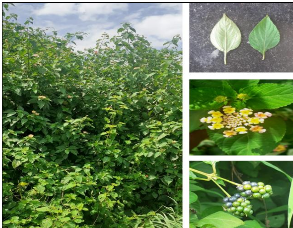
FIG. 1: IMAGES OF LANTANA CAMARA LINN. A) WHOLE PLANT, B) LEAF (DORSAL & FRONTAL VIEW), C) FLOWER, D) FRUITS

Plant Description: 12-14 L. camara is a low erect or subscandent vigorous shrub with a tetragonal stem, a strong odour of black currants and stout recurved pickles. The plant is found up to height 1 to 3 m and its width is 2.5 m. Images of plants, flowers, fruits, front and dorsal view leaf as shown in Fig. 1 .