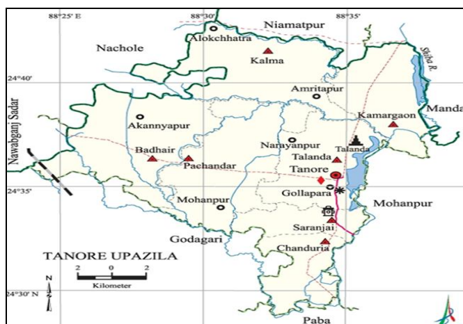
FIG. 1: MAP OF STUDY AREA

the west Nawabganj sadar, on the north-east Manda, and the east Mahanpur Upazila. The climate of this area is generally tropical wet and dry climate, characterized by high temperatures, heavy monsoon, moderate rainfall, and high humidity. The hot season commences early in March and continues till the middle of July. The maximum mean temperature observed is about 32 to 36 °C during April, May, June, and July and the minimum temperature recorded in January is about 7 to 16 °C. The highest rainfall is observed during the months of monsoon. The annual rainfall in the district is about 1,407 mm 7 .