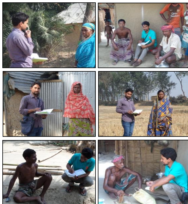
FIG. 2: INTERVIEW WITH SANTAL PEOPLE IN THE STUDY AREA

literature 2, 11, 16, 20, 19 . The voucher specimens are deposited at the Herbarium, Department of Botany, Rajshahi University, Bangladesh for future.