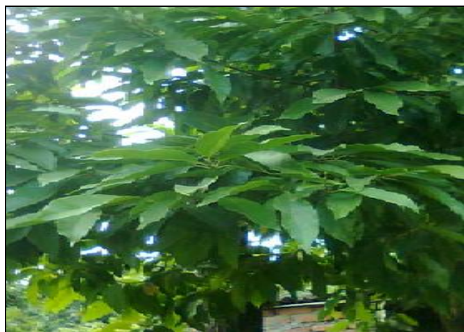
FIG. 1: PICTURE OF PLANT

Botanical Description: M. champaca family Magnoliaceae is a tall, handsome and evergreen tree having a straight trunk, ascending branches, spreading, with closed head 2 . It is medium sized tree about 50 cm in height, and the stem bark is bole straight, cylindrical about 200 cm in diameter. The bark is smooth, grey to greyish white externally and yellowish brown internally, fibrous and the crown is conical to cylindrical 16 . Leaves are acuminate, lanceolate; Blade-20.3-25.4cm long and 3.7- 10.2 cm wide, entire, glabrous above and more or less beneath. Petioles are 18-25 mm long 3-4 . Plant possess wide yellow or orange colored flowers, with strong fragrance about 2.5-5.1 cm in diameter, 15 petals, carpels densely packed on sessile gynophore, about 1-4 seeds of brown color are present inside the fruit 5 as shown in Fig. 1 .