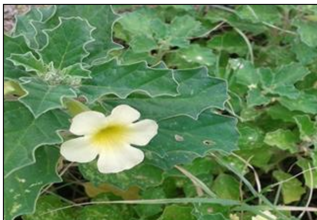
FIG. 1: MORPHOLOGICAL STUDY OF PEDALIUM MUREX LEAVES

Macroscopy Evaluation: The fresh leaves of Pedaliium murex were collected and different organoleptic features like color, odour, taste, size, shape, type were observed. These parameters are considered useful in the qualitative control of the crude drug. Leaves are simple, opposite, ovate or oblong-obovate, 1-4.5 cm long, irregularly and coarsely crenate-serrate.