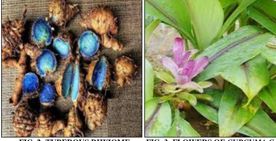
FIG. 2: TUBEROUS RHIZOME