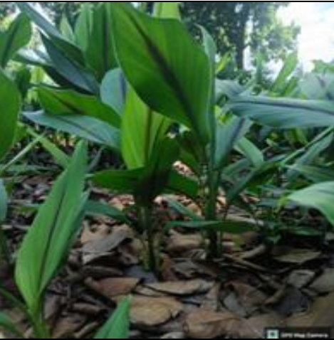
FIG. 1: AERIAL SHOOTS WITH LEAVES OF CURCUMA CAESIA ROXB