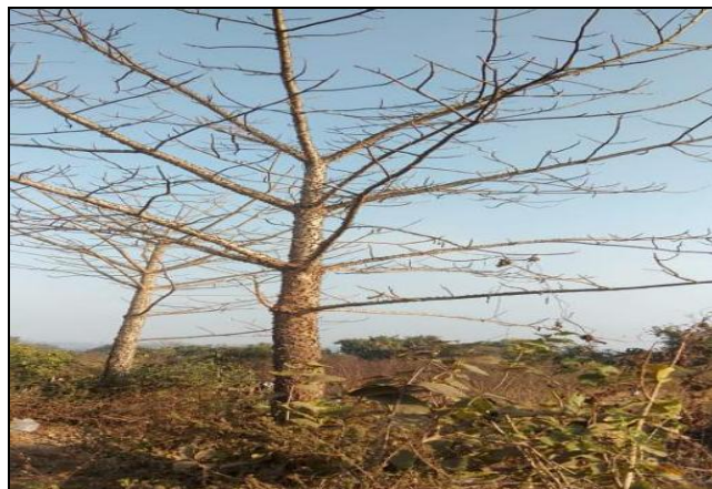
FIG. 1: BOMBAX CEIBA L. TREE

January to February and fruiting period is generally from March to May. Pollination is generally done by birds and bats. Germination through seed mainly (Sint et al. ) 13 . Bombax ceiba L. contain principal constituent are tannin and glycosides which is present in part of leaf and stem. The part of stem shows the presence of some lupeol and b-sitosterol and the leaf shows the presence of alkaloid.