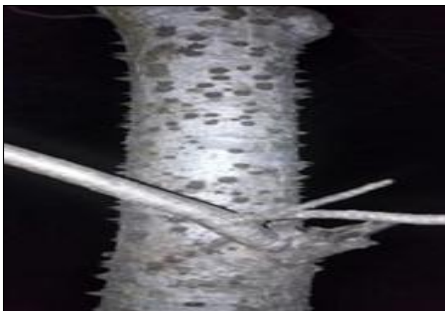
FIG. 2: BOMBAX CEIBA L. BARK

The root bark contains three naphthalene derivatives related to gossypol; it is called semi gossypol. The flower contains b-sitosterol and some traces of essential oil and some natural dyes (Faizi et al. ; Meena et al. ) 5 (Refaat et al. ) 11 . There are different medicinal uses of the plant Bombax ceiba . The part of the plant used for medicinal uses is given in the following chart (Depani et al. ) 2 .