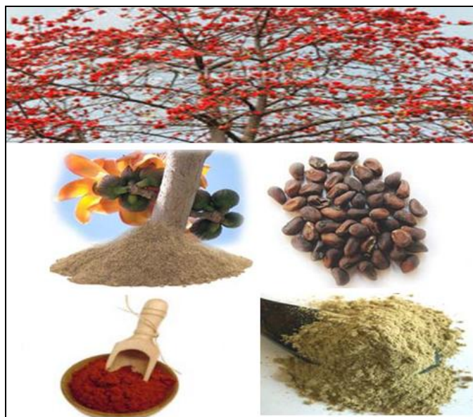
FIG. 5: SEED AND POWDER FORM OF PLANT PART

CONCLUSION: The above literature survey revealed that Bombax ceiba L contains so much medicinal properties. It is used in many herbal