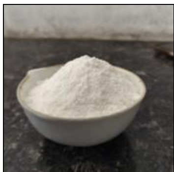
FIG. 1: POWDER OF POTASH ALUM

Alum's ability to block sweat pores is very helpful for its antifungal action. By preventing sweat from escaping, it lowers the moisture content of the site of action, which inhibits the growth of fungal infections. Additionally, alum's antifungal activity also inhibits the growth and development of fungal infections, so it reduces fungal infections in two ways. Wintertime skin cracks are avoided since the alum powder dissolves in water. Because oily skin is more likely to result in pimples and acne, it has the power to dry the skin, which reduces the problem 11 .