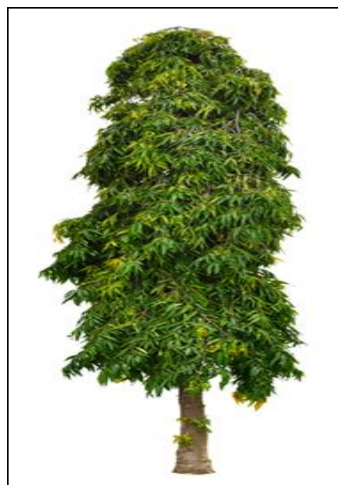
FIG. 1: SARACA ASOCA TREE

In Ayurveda, Ashoka is used in many important formulations against a variety of diseases. Saraca asoca is known to have properties like anti-inflammatory, haemostatic, alexiteric, antibacterial, CNS depressant, anti-pyretic, anthelmintic and analgesic activities 35 . Ashoka is now being categorized as the ‘vulnerable’ in the threatened species list of IUCN due to its habitat loss 36 . Vernacular names and taxonomy of Saraca asoca are shown in Tables 1 and 2 , respectively.