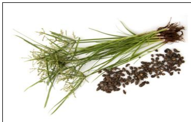
FIG. 1: CYPERUS ROTUNDUS

Apart from its therapeutic uses, it has been called the world's worst weed because it destroys the crops like sugar cane, corn, cotton, rice, and many vegetables in many countries 66 . Vernacular names and taxonomic classification of C. rotundus is given in Table 1 and 2 , respectively.