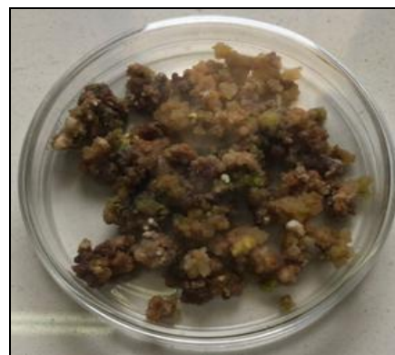
FIG. 3: PHOTOGRAPH OF CALLUS IN BROWN COLOUR, GREEN BUD INITIATION IN BETWEEN THE CALLUS IS ALSO OBSERVED

Embryo Formation: Embryo formation took approximately three months from the time of shoot initiation. As the roots released viable cells, media turned turbid due to various stages of somatic embryos, suspended cells, and roots. The germination of embryos initiated by transferring a few drops of embryonic suspension into a petri plate containing media with varying sucrose concentrations 1%, 2%, and 3%; Fig. 3 . Green mat-like growth on the petri plate took 15 days, while callus like mass embedded on green mat took another 15 days during embryo formation. It took more than 85% regeneration time for the somatic embryo formation on 1/4 -strength MS medium supplemented with 2% sucrose Table 3 . If the callus formation was more profound, leading to secondary embryogenesis, the somatic embryos were sub-cultured to 1/4-strength of MS semisolid medium fortified with 2% sucrose. Subsequent to regeneration, an entire plant from somatic embryos was transferred for hardening and later transferred to the field.