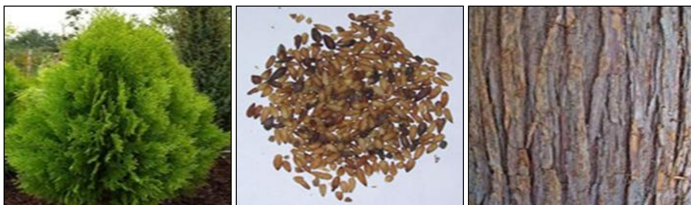
FIG. 1: TREE, SEED, AND BARK

Bark: Shredding, Brown to gray-brown color 3 .