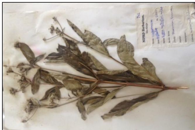
FIG. 1: LIPPIA CHEVALIERI

groups, using essential oils to show chemotypic variation.