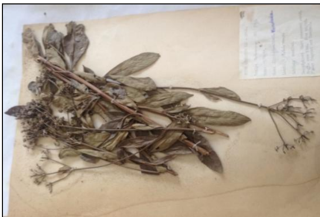
FIG. 2: LIPPIA MULTIFLORA

Ethnopharmacology: Plants belonging to the Lippia genus have been widely used in ethnobotany throughout South and Central America and in tropical Africa as foods, medicines, sweeteners and in beverage flavoring 7 . The Lippia species have a long history of use in traditional medicinal applications some of which have been scientifically validated. They are mostly used in the treatment of respiratory and gastrointestinal disorders. Additionally, they exhibit anti-malarial, spasmolytic, sedative, hypotensive and anti-inflammatory activities 8, 9, 10 . The essential oils of L. alba had been reported to possess anti-spasmodic, digestive, anti-hemorrhoidal and anti-asthmatic activities 11 . Also, antifungal, antibacterial, antiviral, anti-inflammatory and cytotoxic activities have been reported for L. alba 12, 13, 14, 15, 16 .