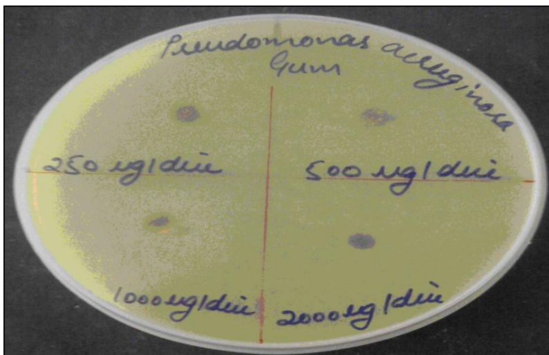
FIG. 1: ANTIMICROBIAL TESTING ON PSEUDOMONAS AERUGINOSA

Antimicrobial and Antifungal activity: The extract of gum from rhizomes of Curcuma amada studied antimicrobial and antifungal activity by cup and plate method.