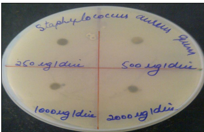
FIG. 2: ANTIMICROBIAL TESTING ON STAPHYLOCOCCUS AUREUS