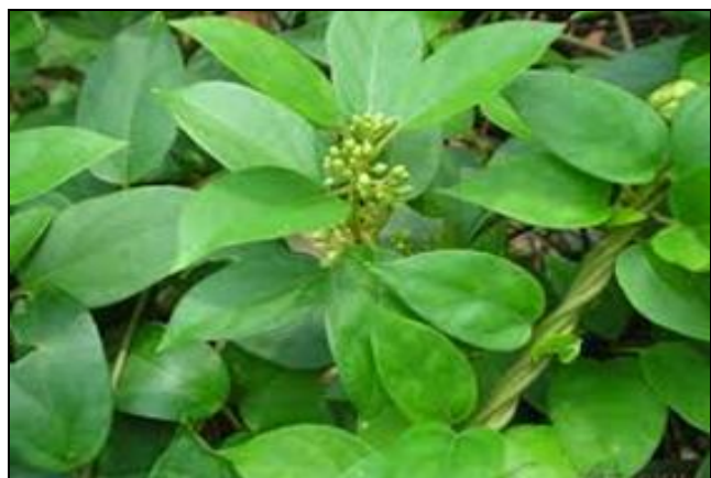
FIG. 1: GYMNEMA SYLVESTRE R.Br