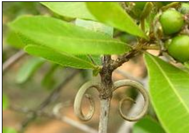
FIG. 1: HUGONIA MYSTAX PLANT

bites. In the form of powder, it is administered internally as an anthelmintic and febrifuge. Hugonia mystax are useful in fever, verminosis and vitiated conditions of veta. Biological activities such as analgesic, anti-inflammatory, ulcerogenic, diabetic were reported 5 .