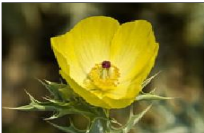
FIG. 2: FLOWER

spiny. The grey-white veins stand out against the bluish-green upper leaf surface. The stem is oblong in cross-section. Flowers are at the tips of the branches (are terminal) and solitary, yellow and of 2.5-5 cm diameter. Fruit is a prickly oblong or egg-shaped (ovoid) capsule. Seeds are very numerous, nearly spherical, covered in a fine network of veins, brownish black and about 1 mm in diameter (Nacoulma, 1996; Bosch, 2008).