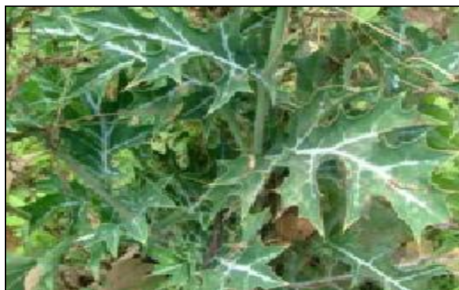
FIG. 3: FRESH LEAVES

Origin and Distribution: Argemone mexicana is native in Mexico and the West Indies, but has become pantropical after accidental introduction or introduction as an ornamental. It is naturalized in most African countries, from Cape Verde east to Somalia, and south to South Africa (Bosch, 2008).