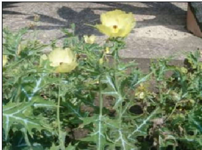
FIG. 1: ARGEMONE MEXICANA