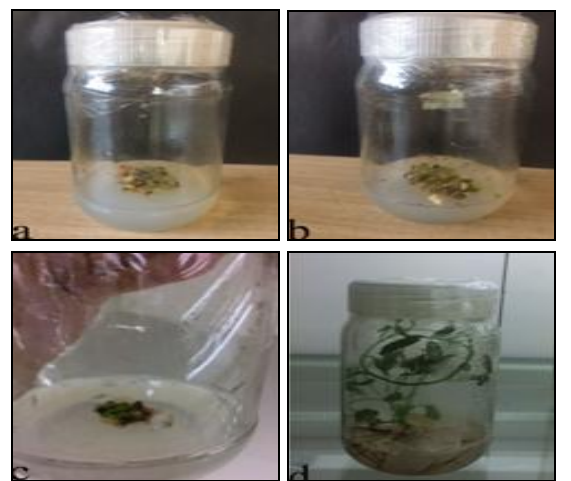
FIG. 2: A, B. PHOTOGRAPH OF CALLUS; C. PHOTOGRAPHS OF INITIATION OF SHOOT BUD FROM THE CALLUS; D. COMPLETE GROWTH OF PLANT FROM THE CALLUS IN MS MEDIUM

The shoot formation appeared, which was then transferred to new flasks, and thus, the whole plant was obtained after 15 days of the root formation Fig. 2c, d.