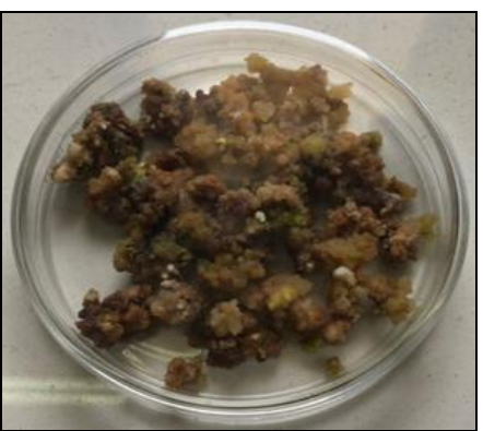
FIG. 3: PHOTOGRAPH OF CALLUS IN BROWN COLOUR, GREEN BUD INITIATION IN BETWEEN THE CALLUS IS ALSO OBSERVED

Embryo Formation: Embryo formation took approximately three months from the time of shoot initiation. As the roots released viable cells, media turned turbid due to various stages of somatic embrvos. suspended cells, and roots. The germination of embryos initiated by transferring a few drops of embryonic suspension ion to petri plate containing media with varying sucrose concentrations 1%, 2%, and 3%; Fig. 3. Green matlike growth on the petri plate took 15 days, while callus like mass embedded on green mat took another 15 days during embryo formation. It took more than 85% regeneration time for the somatic embryo formation on 1/4 -strength MS medium supplemented with 2% sucrose Table 3. If the callus formation was more profound, leading the secondary embryogenesis, the somatic embryos were sub-cultured to 1/4-strength of MS semisolid medium fortified with 2% sucrose. Subsequent to regeneration, an entire plant from somatic embryos was transferred for hardening and later transferred to the field.