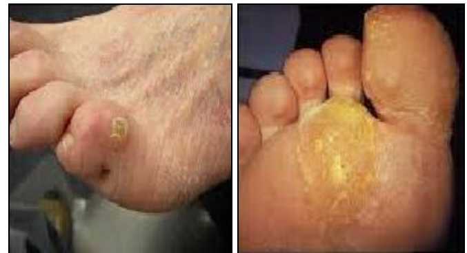
FIG. 1: DIFFERENCE BETWEEN CORN AND CALLUS

Corns: A corn is a circumscribed hyperkeratotic lesion with a central conical core of keratin that causes pain and inflammation. The core in corn which thickening of the stratum corneum, is a protective response to the mechanical trauma. This central core distinguishes the corn from callus. Difference between corns and callus Corns are smaller than calluses and have a hard center surrounded by inflamed skin. They develop on parts of the body that do not carry any weight, such