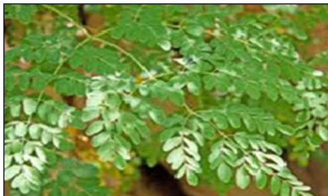
FIG. 5: MORINGA OLEIFERA

Synonym: English common names include: Moringa, Drumstick tree, Dorseradish tree, Shevga.