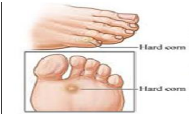
FIG. 2: HARD CORN

Soft corn results from the absorption of an extreme amount of moisture from perspiration and is noted by its characteristic macerated appearance. The soft corn is an extremely painful lesion that can be developed between the fourth and fifth toes. The common causes of hard and soft com are hammering toe deformity appearance 16 .