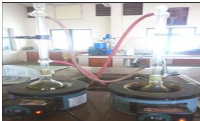
FIG. 8: WATER EXTRACTION