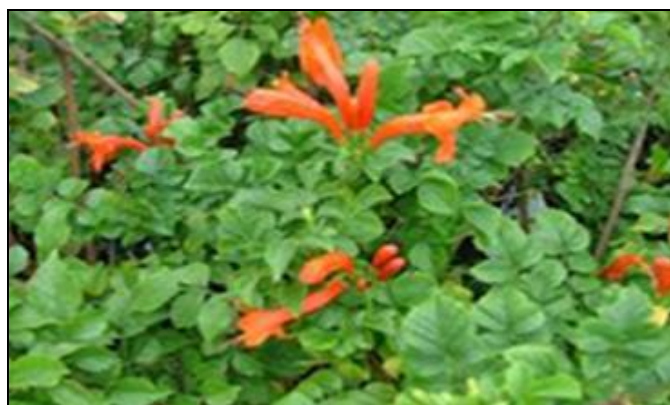
FIG. 6: TECOMA CAPENSIS

Description: An erect, scrambling shrub, it grows to 2 - 3 m (7 - 10 ft) in height and a similar width. Normally evergreen, it may lose its leaves in colder climates. In certain habitats it may scramble, meaning that it shoots out long growth tips which lean on the stems and branches of other plants, as well as boulders, trellises, fences, and walls; this can lead to the plant appearing untidy. The leaves are up to 15 cm (6 in) long. They are opposite, slightly serrated, green to dark-green, and pinnate with 5 to 9 oblong leaflets.