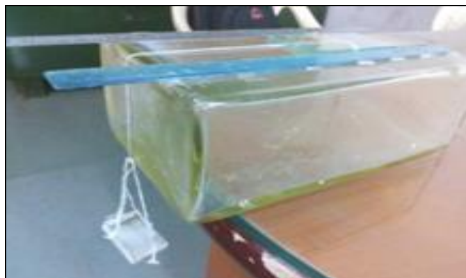
FIG. 9: SPREADABILITY APPARATUS

placed over one of the slides. The other slides were placed on the top of the ointment such that the formulation is sandwiched between the two slides in an area occupied by a distance of 6.0 cm, alongside 100 gm weight was placed uniformly to form a thin layer. The weight was removed, and the excess of ointment adhering to the slides was scrapped off. The two slides in position were fixed to a stand (45° angle) without slightest disturbance and in such a way that only the lower slides was held firmly by the opposite fangs of the clamps allowing the upper slides to slip off freely by the force of weight tied to it. 20 grams of weight was tied to the upper slide carefully. The time taken for the upper slide to travel the distance of 5 cm and separate away from the lower slides under the direction of weight was noted. The experiment of repeated and the mean time taken for three such dimensions was calculated. The results were recorded.