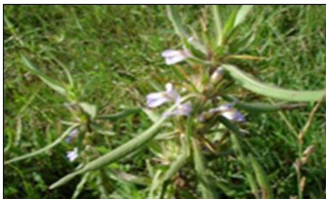
FIG. 7: BARLERIA PRIONITIS

Biological Source: It is a fresh leaf of plant Barleria prionitis , is a species of plants belonging to the family Acanthaceae.