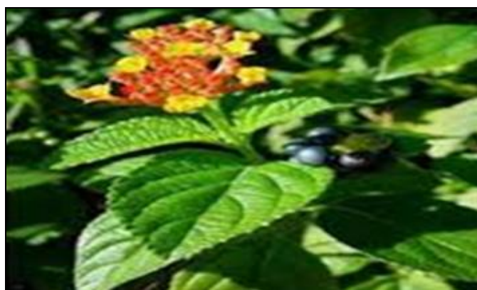
FIG. 4: LANTANA CAMARA

Biological Source: It is dried leaves of plant Lantana camara Linn. belonging to the family Verbenaceae. Lantana camara , is a species of flowering plant within the verbena family, Verbenaceae.