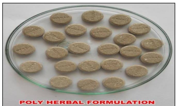
FIG. 1: PREPARED POLYHERBAL FORMULATION

The percent decrease in blood glucose levels after the oral administration of polyherbal formulation