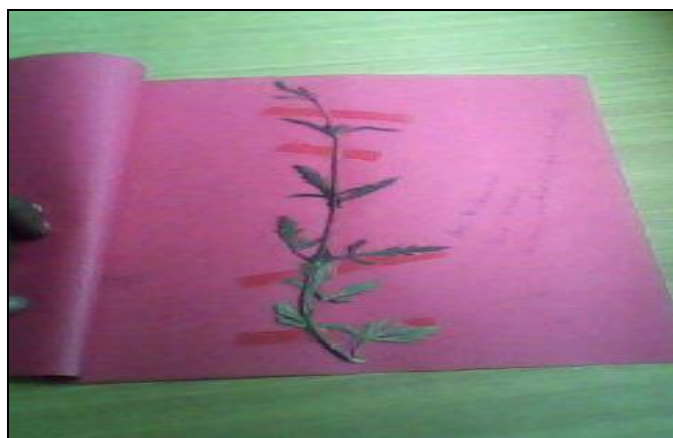
FIG. 1: PICTURE OF VERBENA OFFICINALIS (PHOTO TAKEN IN THE MICROBIOLOGY LABORATORY)

Plant Material Collection and Preparation of Extract: The whole part of the plant, Verbena officinalis , was collected from around Mekelle City from June to September 2013. The test plant was taxonomically identified at the herbarium in the Department of Biology, Mekelle University Fig. 1 . The leaf of the plant was air-dried at room temperature under the shed, and crushed by grinder machine. The crude extract was prepared according to the procedure described by Shewit et al. 8 The dried leaves were powdered, measured and macerated three times in 80 % methanol for about 72 h. After 72 h, the filtrate was concentrated by rotary evaporator under reduced pressure. The crude extract was kept in a closed container in a refrigerator at 4°C until used for the test.